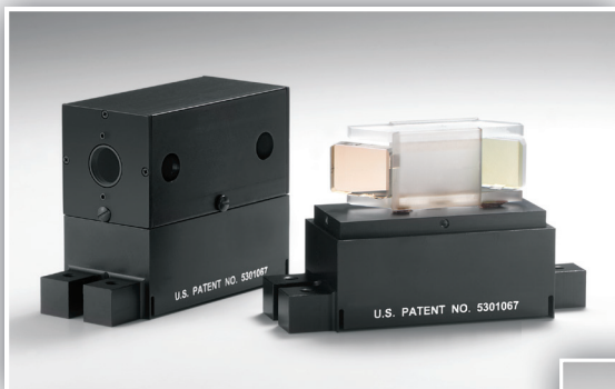
Beam separator: Separates one input beam with multiple wavelengths into 3 different outputs for metrology applications.

PLX has developed M.O.S.T.™ based upon their mature, proprietary optical technology. This technology makes it possible to integrate different glass types and exotic materials, such as KBr, ZnSe, CaF 2 and Spinel, into a M.O.S.T.™ assembly. This is especially useful when the system has to perform in broadband light applications, such as FTIR. This integration results in a "sandwich structure," or solid box-like assembly that not only exhibits exceptional thermal and mechanical stability but also lasts indefinitely.